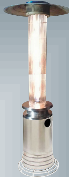
HFG-001 LPG GLASS HEATER