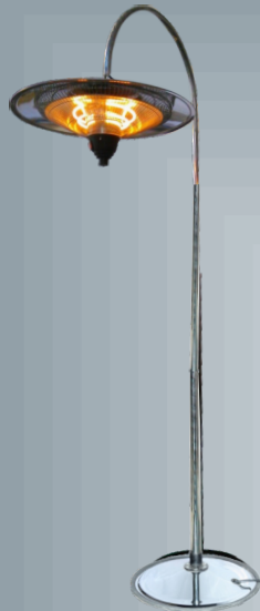
EHP-104 S.S. U SHAPE ELECTRIC HEATER WITH HEIGHT ADJUSTMENT