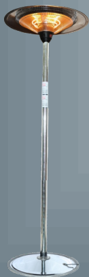
EHS-100 S.S. ELECTRIC HEATER WITH HEIGHT ADJUSTMENT