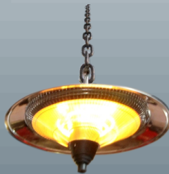
EHC-101 CEILING MOUNT ELECTRIC HEATER