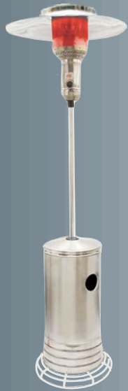
HFS-100 S.S. OUTDOOR LPG HEATER