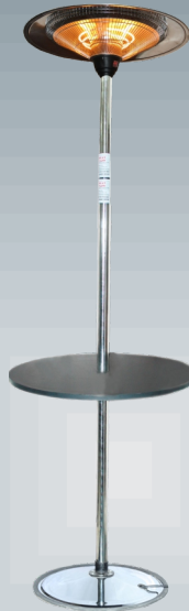
EHS-100 S.S. ELECTRIC HEATER WITH TABLE