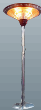
EHB-103 S.S. FLOOR & TABLE MOUNT ADJUSTABLE HEIGHT ELECTRIC HEATER