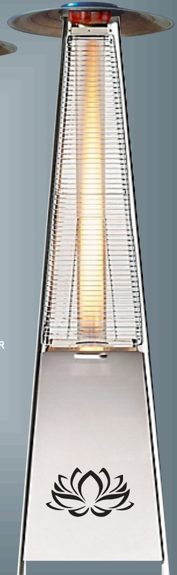
HFGP-220 LPG PYRAMID HEATER